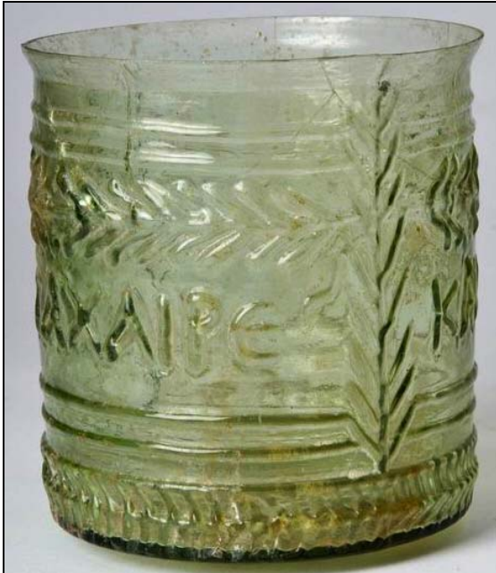
Abb. 2011-4/225 Becher und 2 Krüge form-geblasenes Glas, Ennion, 1. Jhdt. n.Chr. Bilder aus International Seminar, Israel Museum, Jerusalem 2012: Early Roman Decorative Glass: East and West Dialogue Photos: © Shlomo Moussaieff, by Ardon Bar-Hama

tion of mold-blown glass throughout the Roman Empire.